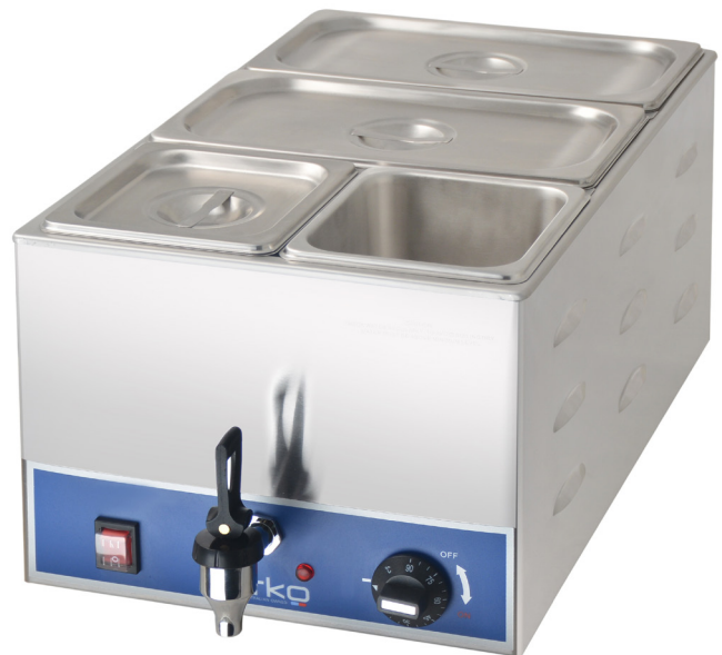
Note: pans & lids are not included