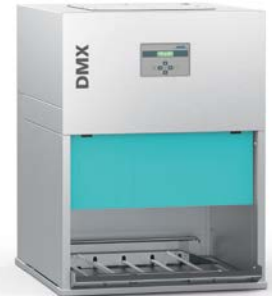
Front loading with base tray

LEARN MORE ABOUT OUR DRYING DEVICES NOW: