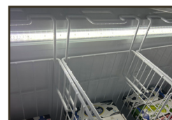
LED internal light