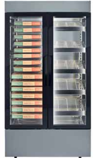
Model 1000, stainless steel

**Using Flexeserve Hub merchandising accessories.