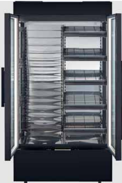
Model 1000, Black Edition