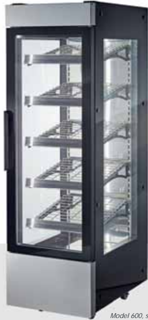
Model 600, stainless steel