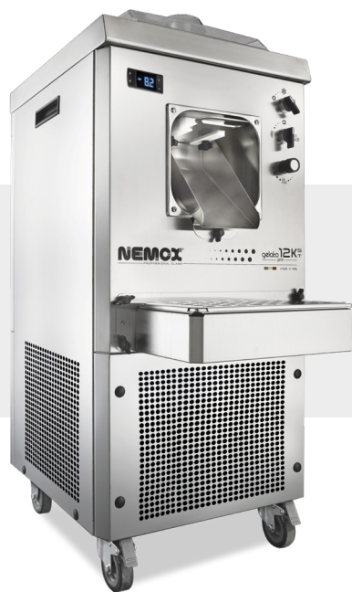
GELATO 12K ST

Equipment for your business and for your home