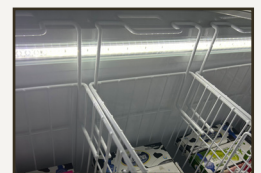
LED internal light