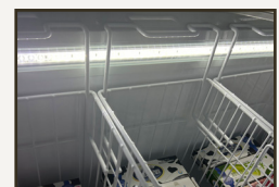
LED internal light