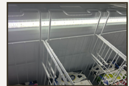
LED internal light