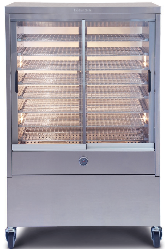
Optional HT200 Trolley for ease of placement