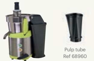
Pulp tube Ref 68960

Delivered with a pulp tube , which goes directly through your counter to the waste collector below.