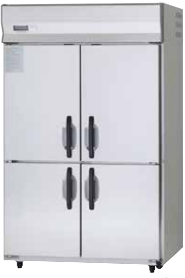
2 DOOR SPLIT DOOR SRR-1281HP(AUS)

EXTERNAL DIMENSIONS: W1210 x D800 x H1995mm*