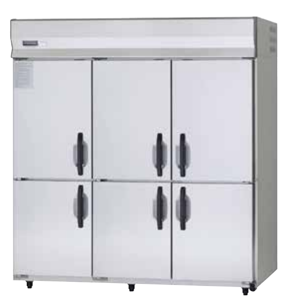
3 DOOR SPLIT DOOR SRF-1881HP(AUS)

EXTERNAL DIMENSIONS: W1800 x D800 x H1995mm*