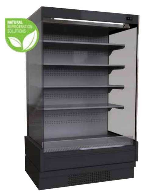
SELF CONTAINED UPRIGHT CHILLER CABINET H1T-10/14/19/26*

EXTERNAL DIMENSIONS: W1040/1350/1980/2600 x D860 x H2090mm