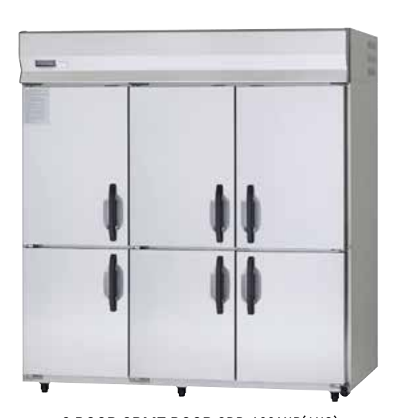
3 DOOR SPLIT DOOR SRR-1881HP(AUS)

EXTERNAL DIMENSIONS: W1800 x D800 x H1995mm*