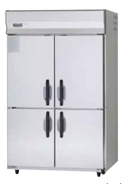
2 DOOR SPLIT DOOR SRF-1281HP(AUS)

EXTERNAL DIMENSIONS: W1210 x D800 x H1995mm*