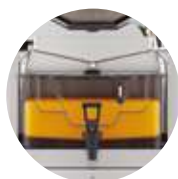
Speed S +plus Tank All-in-One