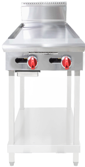
Model shown with optional equipment stand