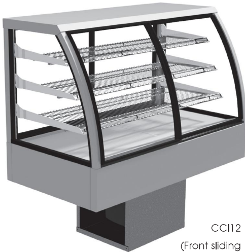
CCI12 (Front sliding door option)