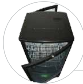
Double lockable curved doors