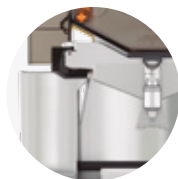
Speed S +plus All-in-One

Dimensions 23.3" x 26.2" x 41.3" Net weight 184.1 lb