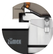
Speed S +plus