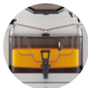
Speed S +plus Tank All-in-One

Choose your Podium according to your space and style.