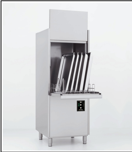
Accessories not included