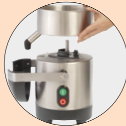
Stainless-steel bowl and motor unit for easy aftercare