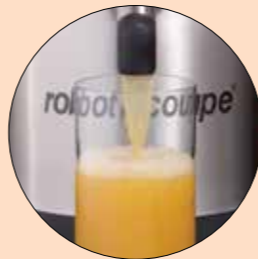
High output and unrivalled juice quality