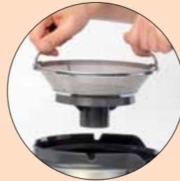
Removable stainless-steel basket