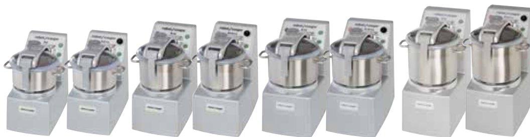
R 8 - R 8 V.V.