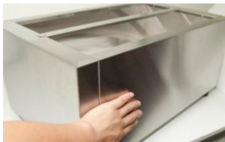
Cool-to-touch safety feature during operation