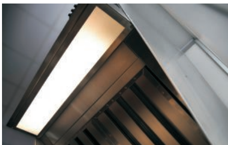
Includes fluorescent lighting