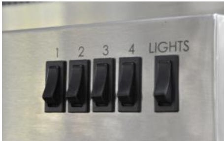
Multiple speed fan selection