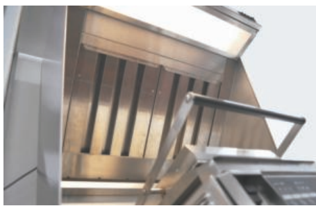
Designed for use over benchtop equipment