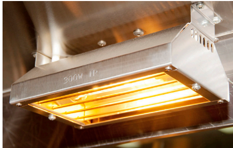
Quartz infra-red overhead heat lamps

Combining these market leading features has resulted in rear ventilation, that reduces condensation build up on the front glass.