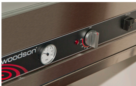
Precise thermostat control