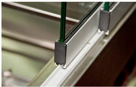
Glass doors to rear of unit