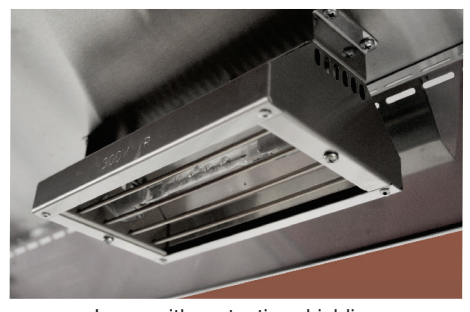
Lamp with protective shielding