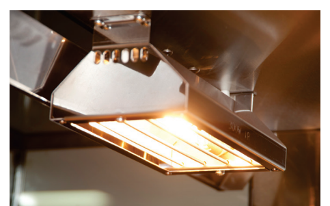
Overhead heat lamps

Woodson heat lamps provide optimum heat and lighting to all food preparation and serving areas.