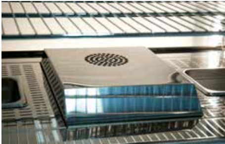
Ventilated air is blown through the unit

The Woodson high impact food displays are designed to increase the product's visual appeal and increase the volume of products displayed, while maintaining the quality of the product